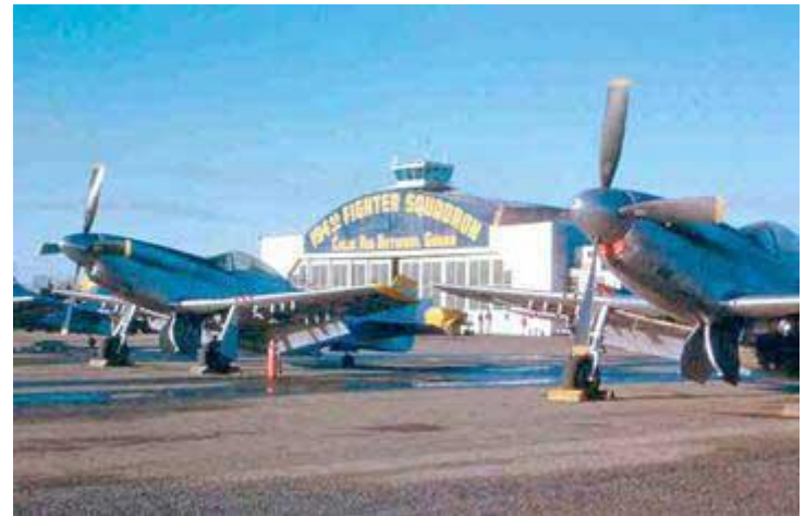
P-51D's of the 194th Fighter Squadron at Hayward ANG Base